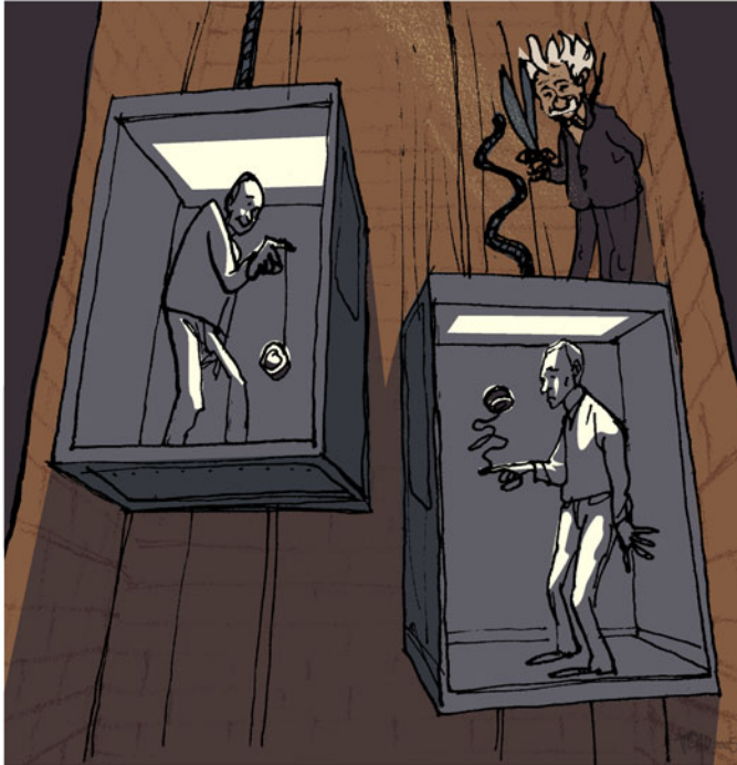
Abbildung 8. The indistinguishability of gravitational and inertial forces, illustrated by the elevator thought experiment. By Laurent Taudin.

transformation of this mechanics. And its validity, too, is not conceivable without this genesis, for it rests, just as was the case for the general theory of relativity, not only on the specific observational and experimental knowledge that accompanied its emergence, but on the whole body of empirical knowledge that had supported the classical mechanics before it.