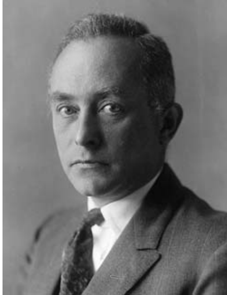
Abbildung 6. Max Born (1882–1970).

made some kind of covibration necessary, for otherwise it was practically impossible to understand why the classical explanation based on this assumption was so successful.