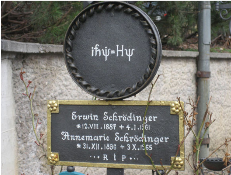
Abbildung 2. Tombstone of Annemarie and Erwin Schrödinger (1887–1961) with the Schrödinger equation i\hbar\psi = H\psi in modern notation. Photo by C. Joas, 2008.

of the experimental observation of the real world (Feynman et al. , 1965, chapter 16, p. 12).