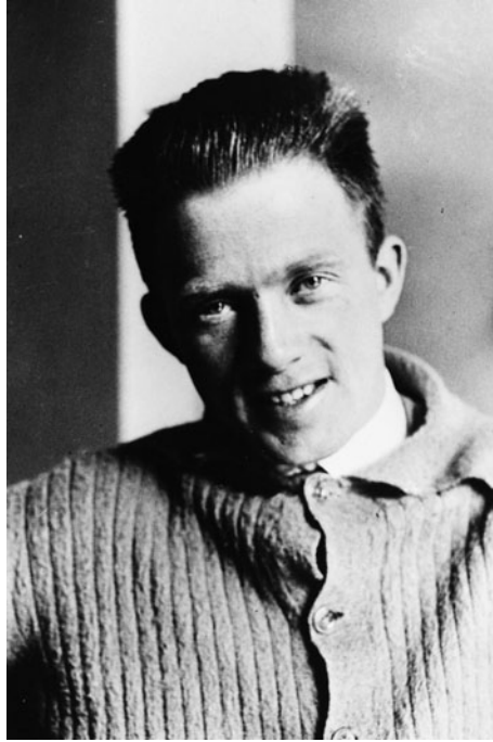
Abbildung 5. Werner Heisenberg (1901–1976).

Yet for Heisenberg, who was 25 at the time, feeling “26 years younger” in the face of Schrödinger’s theory meant that he must associate it with the dawn of quantum theory, the age of the classical physics of the 19th century. In the same letter he did, in fact, call Schrödinger’s physics “classicist” and accuse him of having made it too simple by “throwing overboard” all substantial quantum effects. Heisenberg, on the other hand, had come to his own theory, which later became known as matrix mechanics, by occupying himself laboriously and step by step with these quantum problems.