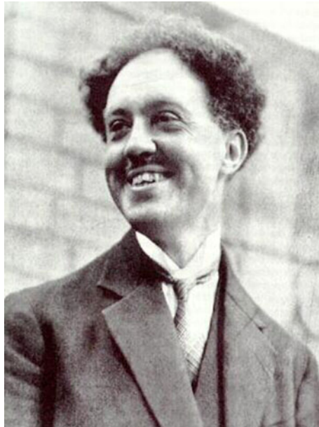
Abbildung 3. Louis de Broglie (1892–1987).

of 1924 (de Broglie, 1924). 6 In order to supplement the wave picture of matter, he used, in addition to Planck's relation between energy and frequency, another relation that was just as simple: one between wavelength \lambda and momentum p :