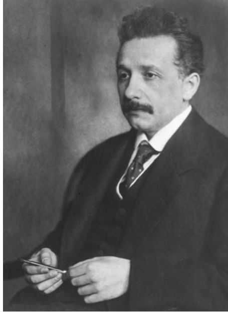
Abbildung 7. Albert Einstein (1879–1955).

theories and was not discovered at all until so long after they were formulated. 25 The notion of a world of Platonic ideas, which guide knowledge so little in the real world, is not terribly convincing.