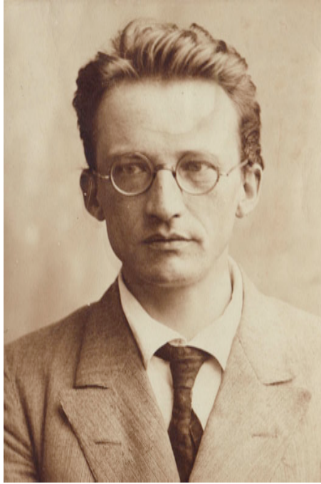
Abbildung 1. Erwin Schrödinger (1887–1961), ca. 1926.

physics. Arnold Sommerfeld once referred to it as “the most remarkable of all remarkable discoveries of the 20th century.” When Max Planck held Schrödinger’s second publication in his hands, he related to Schrödinger on a post card: